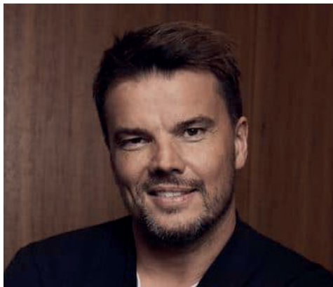
BJARKE INGELS Architect (Denmark)