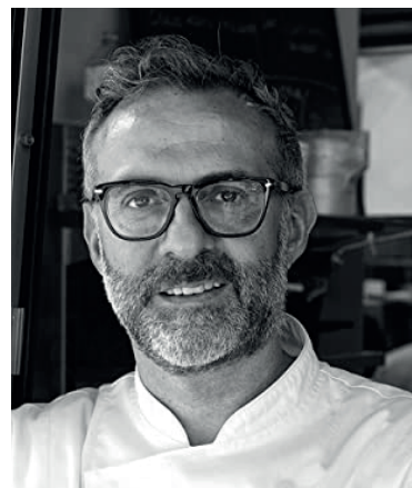
MASSIMO BOTTURA Chef (Italy)