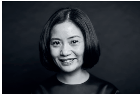
GUO PEI Fashion designer (China)