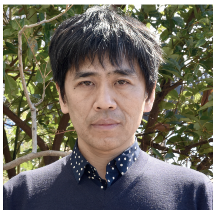
RYÛE NISHIZAWA Architect (Japan)