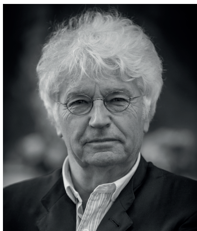
JEAN-JACQUES ANNAUD Film director, Chairman of the World Jury (France)