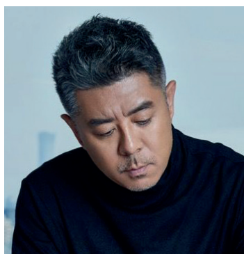
MA YANSONG Architect (China)