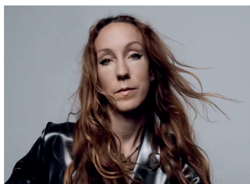
IRIS VAN HERPEN Fashion designer (Netherlands)