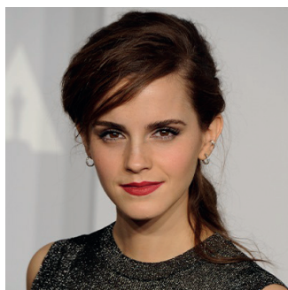
EMMA WATSON Actress (United Kingdom)