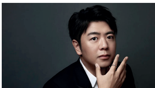
LANG LANG Pianist (China)