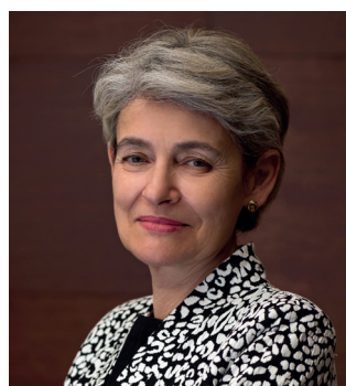
IRINA BOKOVA Former Director-General of the UNESCO Chairperson of the World Jury (Bulgaria)