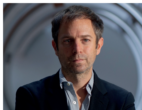
LEANDRO ERlich Conceptual artist (Argentina)